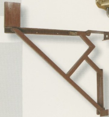
QUICK-LOCK SCAFFOLD BRACKET