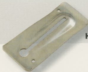
HEAVY STEEL WEDGE

QUICK-LOCK TIES (Ultimate tensile strength = 4,500 lbs.) In lengths from 6" to 24"