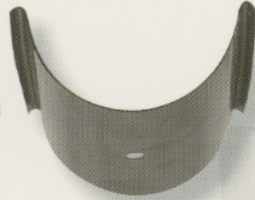
ELLIS RESHORE SPRING