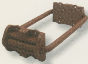
ELLIS SHORE CLAMP 4 x 4