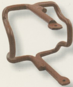
SHORE HOLDER 4 x 4